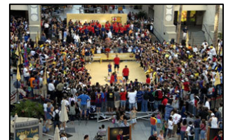
Nike FC Barcelona Promotion