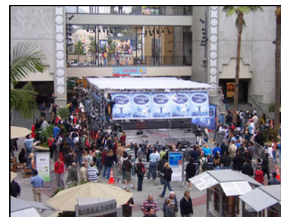
FOX News American Idol Live Broadcasts