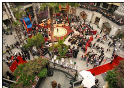
Daytime Emmys Fan Zone