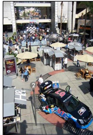
CA Speedway Day in LA