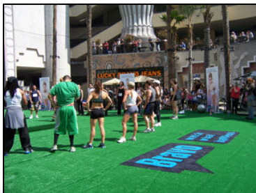
Bravo WORKOUT Promotion