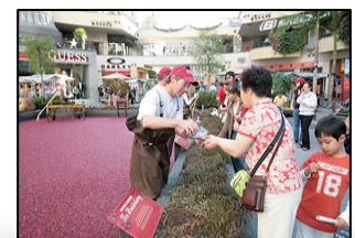
Ocean Spray Bogs Across America