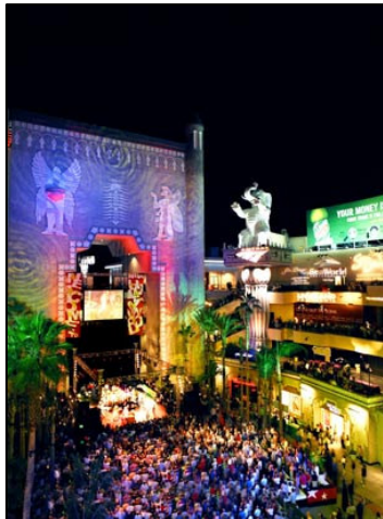
International Pow Wow Tourism Event