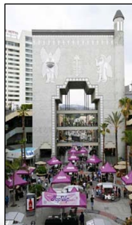
Allure Magazine Pop Up Party